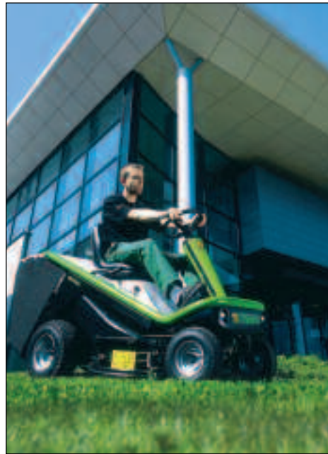
Etesia's Hydro 80 commercial ride-on mower

Etesia's Hydro 80 ride-on rotary mower is built for reliability and durability in tough working conditions. Its compact 80 cm cutting deck allows it to access places where other ride-ons cannot go. A tight turning circle plus hydrostatic drive in both forward and reverse ensure ease of use and mowing efficiency.