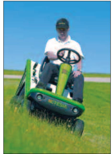
Hydro 80 "work horse"

Powered by a 15hp twin cylinder Kawasaki engine, the anti-clog Hydro 80 gives a quality finish on lawns as well as rough grass; it even collects leaves and litter. Designed for commercial use, Etesia mowers often operate in tough conditions over long periods, so top quality components are essential.